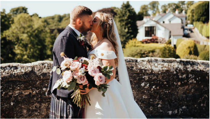
BRIG O' DOON ALLOWAY

Centrally located for easy access to Ayr & Prestwick. The Carlton Hotel Prestwick boasts beautiful landscaped gardens providing a picturesque backdrop for your wedding.