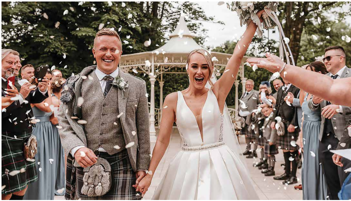
DALMENY PARK GLASGOW

Brig o' Doon is an iconic venue set amidst several acres of perfectly manicured gardens and grounds. Located in the heart of historic Ayrshire it is one of Scotland's most well-known wedding venues.