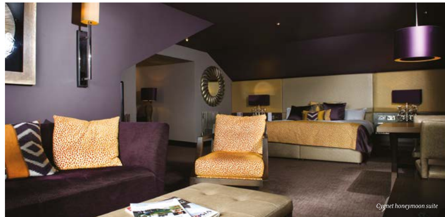
Cygnet honeymoon suite

Upgrade to our Cygnet honeymoon suite, overlooking the Loch of Lowes and Afton hills, the perfect ending to the most magical day of your life.