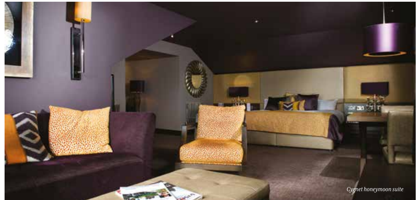
Cygnet honeymoon suite

Upgrade to our Cygnet honeymoon suite, overlooking the Loch of Lowes and Afton hills, the perfect ending to the most magical day of your life.