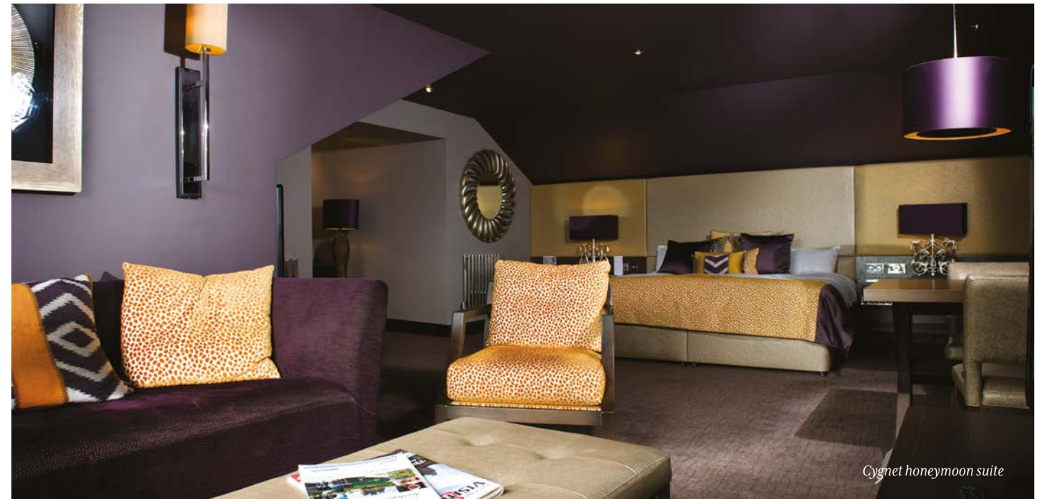
Cygnet honeymoon suite

Upgrade to our Cygnet honeymoon suite, overlooking the Loch of Lowes and Afton hills, the perfect ending to the most magical day of your life.