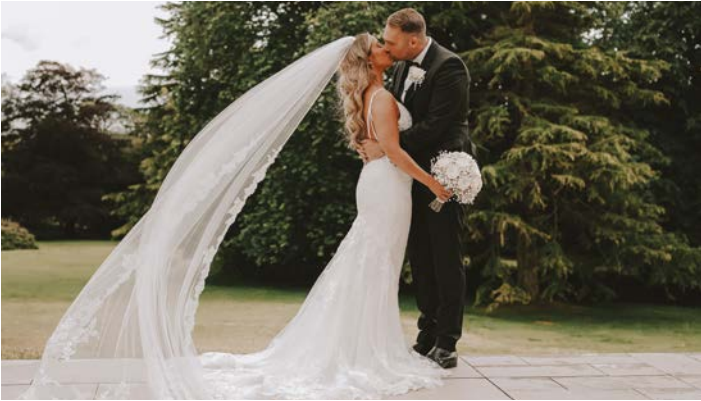
HETLAND HALL DUMFRIES

Dalmeny Park is an impeccable Scottish Mansion set amidst several acres of magnificent gardens and grounds.