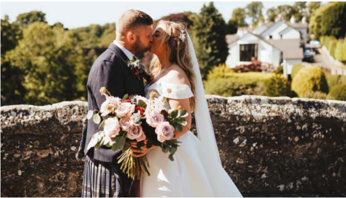
BRIG O' DOON ALLOWAY

Centrally located for easy access to Ayr & Prestwick. The Carlton Hotel Prestwick boasts beautiful landscaped gardens providing a picturesque backdrop for your wedding.