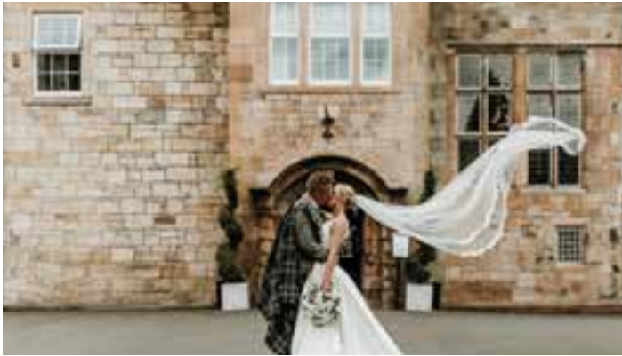
DALMENY PARK GLASGOW

Seamill Hydro Hotel is a romantic Victorian venue with mesmerising views of the Firth of Clyde and Mountains of Arran, making it the perfect setting for your special day.