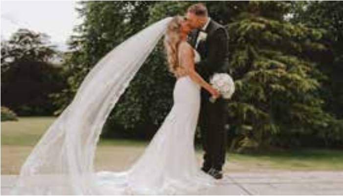
HETLAND HALL DUMFRIES

The Radstone Hotel is tucked away in rural Lanarkshire. Set in its own extensive grounds with striking scenery and landscaped gardens.