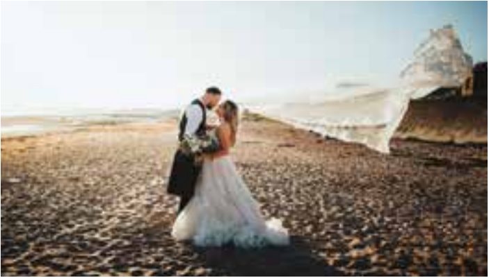
SEAMILL HYDRO WEST KILBRIDE

Brig o' Doon is an iconic venue set amidst several acres of perfectly manicured grounds. Located in the heart of historic Ayrshire, it is one of Scotland's most well-known venues.