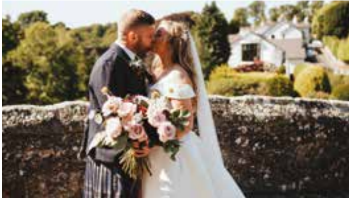
BRIG O' DOON ALLOWAY

Hetland Hall Hotel is an elegant country house set amidst picturesque gardens and grounds. The romantic ceremony suite offers sweeping views of the Solway Firth with stylish interiors, we can think of no better setting.