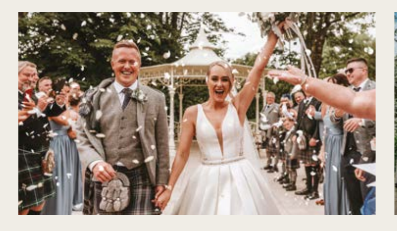
DALMENY PARK GLASGOW

The Radstone Hotel is tucked away in rural Lanarkshire. Set in its own extensive grounds with striking scenery and landscaped gardens.